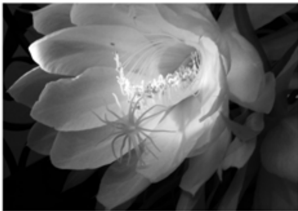
Night Blooming Cereus.