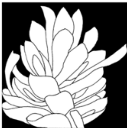
"White Ginger" ink drawing by Elaine Losey