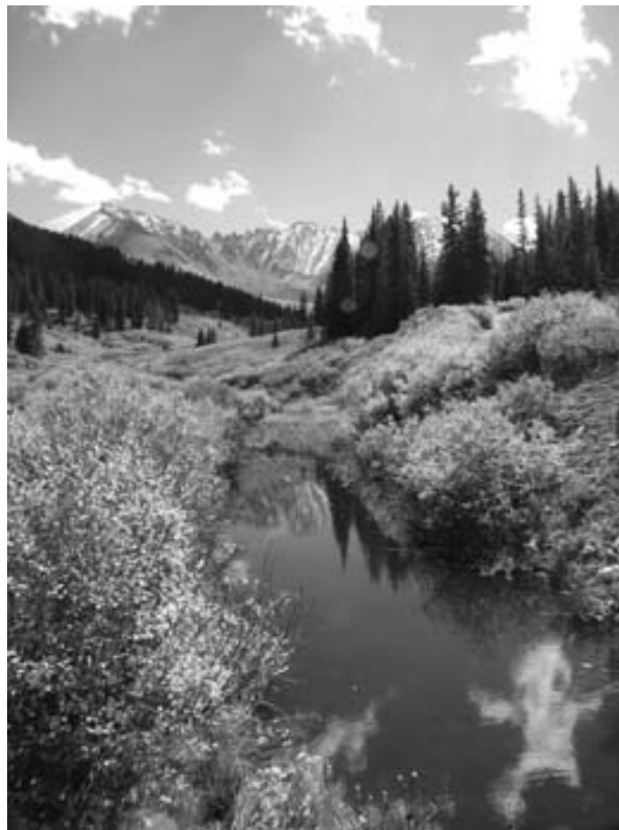
Rocky Mountains