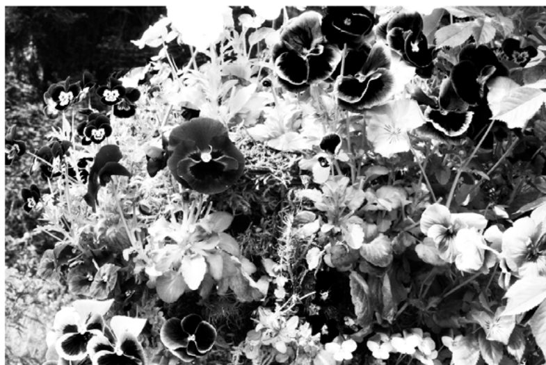
Pansies