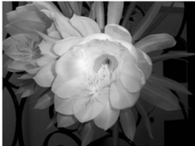
"Night Blooming Cereus Pair"